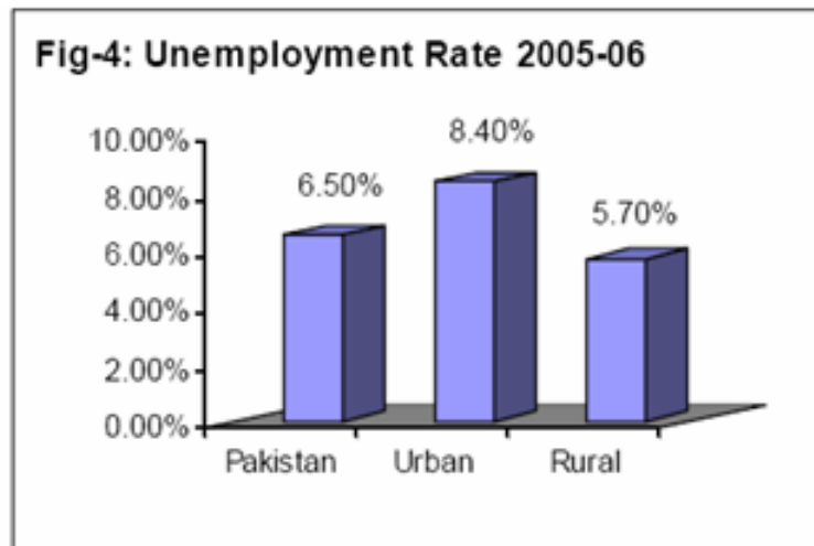
Table 3. Pakistan’s Unemployment Rate 2005–2006 From: Economic Survey of Pakistan 2005–2006. 60