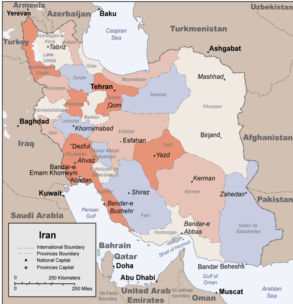
Figure 2. Map of Iran