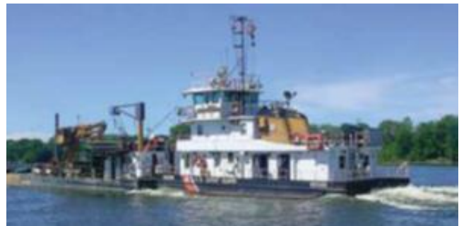
Figure 1. Coast Guard River Buoy Tender (WLR)

As of 2019, the 13 WLICs were based at cities along the U.S. East and Gulf coasts in Alabama, Florida (three cutters), Louisiana (two cutters), Maryland, North Carolina, South Carolina, Texas (three cutters), and Virginia. As of 2019, the four WLIs were based at locations in Alaska, Michigan, Oregon, and North Carolina.