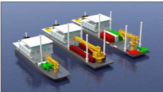
Figure 2. Coast Guard Notional Designs for WLR, WLIC, and WLI