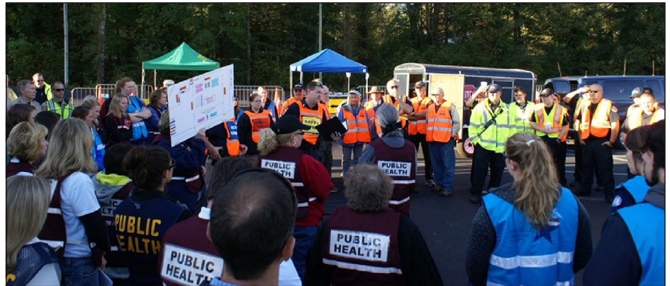
Figure 1: Participants in a Biological Incident Exercise

Source: Centers for Disease Control and Prevention. | GAO-22-105733