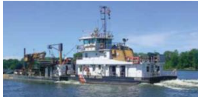
Figure 1. Coast Guard River Buoy Tender (WLR)

As of 2019, the 13 WLICs were based at cities along the U.S. East and Gulf coasts in Alabama, Florida (three cutters), Louisiana (two cutters), Maryland, North Carolina, South Carolina, Texas (three cutters), and Virginia. As of 2019, the four WLIs were based at locations in Alaska, Michigan, Oregon, and North Carolina.