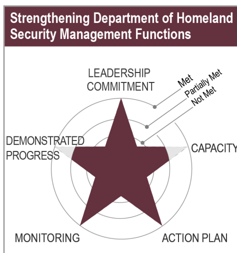
Figure 1: GAO’s 2021 High-Risk Rating for Strengthening Department of Homeland Security Management Functions

DHS’s efforts to strengthen and integrate its acquisition, IT, financial, and human capital management functions have resulted in the department meeting three of five criteria for removal from the High-Risk List—leadership commitment, action plan, and monitoring. DHS has partially met the remaining two criteria—capacity and demonstrated progress, as shown in figure 1.