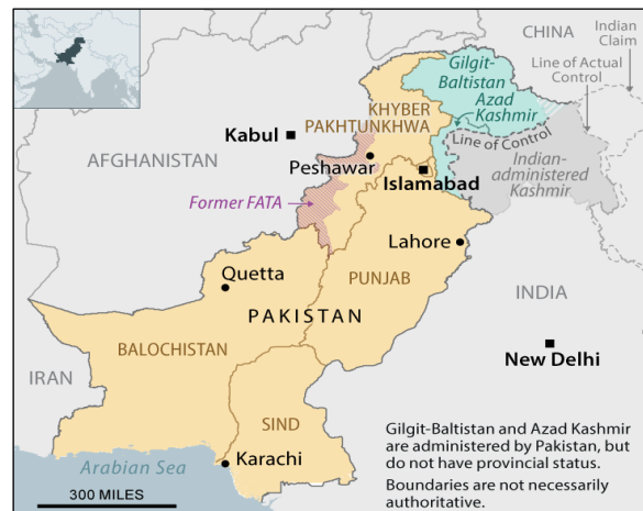
Figure 2. Map of Pakistan