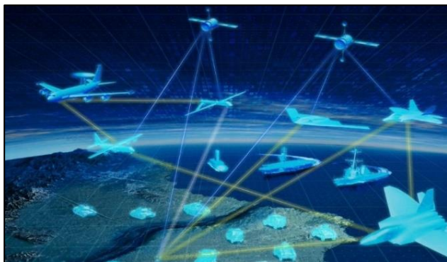
Figure 1. Visualization of JADC2 Vision