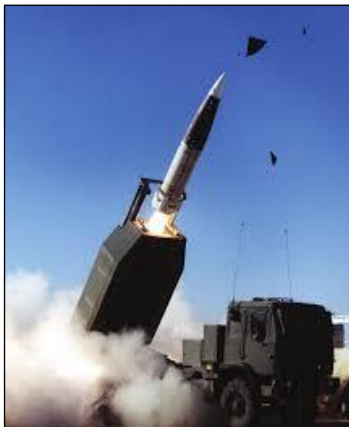
Figure 4. ATACMS Launching