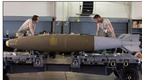
Figure 2. GBU-31 Joint Direct Attack Munition