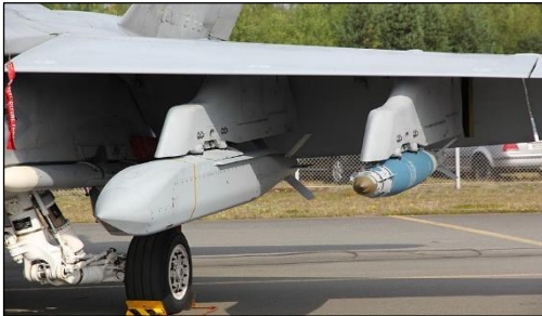
Figure 3. JASSM Attached to an F/A-18D Hornet