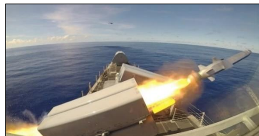
Figure 5. NSM at Launch