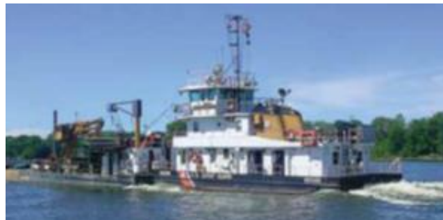
Figure 1. Coast Guard River Buoy Tender (WLR)

As of 2019, the 13 WLICs were based at cities along the U.S. East and Gulf coasts in Alabama, Florida (three cutters), Louisiana (two cutters), Maryland, North Carolina, South Carolina, Texas (three cutters), and Virginia. As of 2019, the four WLIs were based at locations in Alaska, Michigan, Oregon, and North Carolina.