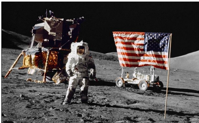
Figure 1. The Last Human Lunar Mission: Apollo 17