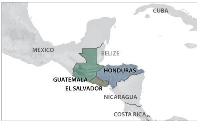
Figure 1. Northern Triangle of Central America

According to a model developed by academics at the University of Texas at Austin, an estimated 311,000 people, on average, left the Northern Triangle region of Central America (see Figure 1 ) annually from FY2014 to FY2020, with the majority bound for the United States. Flows have varied from year to year, however, with an estimated 709,000 people leaving the region in FY2019 followed by an estimated 139,000 people leaving the region in FY2020. Surveys conducted in 2020 found that many potential migrants in the region had postponed their plans in the midst of the Coronavirus Disease 2019 (COVID-19) pandemic but intended to undertake their journeys once governments lifted cross-border travel restrictions.