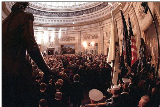
Figure 3. President Ronald Reagan's 1985 Public Inauguration Ceremony

Source: Library of Congress, Fish-eye view of the rotunda in the U.S. Capitol, just prior to the swearing-in ceremony of Ronald Reagan. Washington, DC, 1985. Photograph. https://www.loc.gov/item/00652317 .