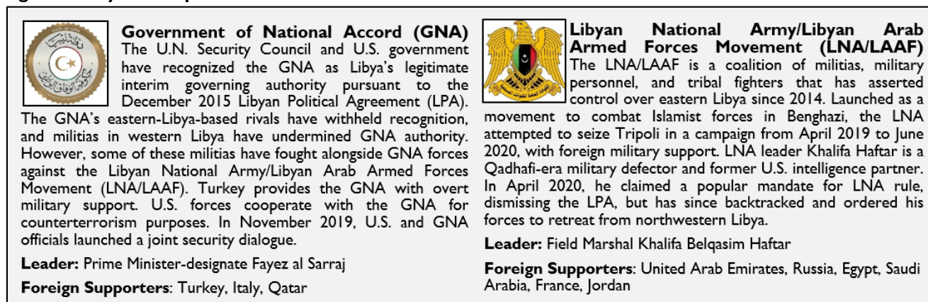
Figure 2. Libya: Principal Coalitions