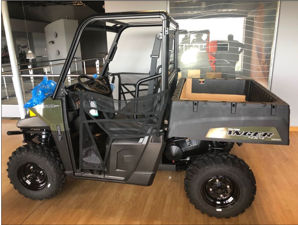
Figure 3: All-Terrain Vehicle New Mexico Border Authority Donated to U.S. Customs and Border Protection at the Santa Teresa Port of Entry

GAO-20-255R