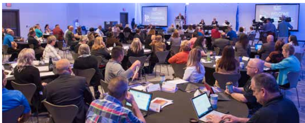
The AMBER Alert National Symposium events bring together AMBER Alert partners including AMBER Alert Coordinators and other child protection officials, and offer an important opportunity to learn and collaborate together across state and regional boundaries.

Collectively, these partnerships, as well as leaders at various levels of government and in the private sector, have played and continue to play a critical role in improving the AMBER Alert program and comprehensive child recovery strategies across the nation.