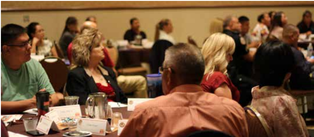
Participants attend a presentation at an AMBER Alert in Indian Country symposium.