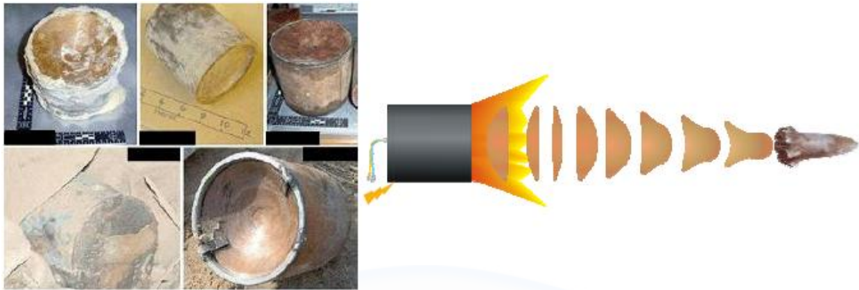
Figure 2. Explosively Formed Projectile (EFP).

shaped charge moving at over one mile per second—faster than a rifle round. This shaped charge penetrates most kinds of armor, including that of the MRAP. EFPs first appeared in Iraq in May 2004, and the US Government has linked them to Iran. 25