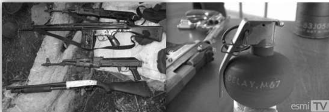
Figure 2: War Weapons used by Gangs.