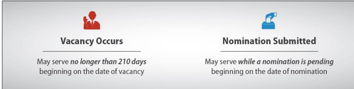
Figure I. Two Limited Periods of Service

Consequently, the submission and pendency of a nomination allows an acting officer to serve beyond the initial 210-day period. 97