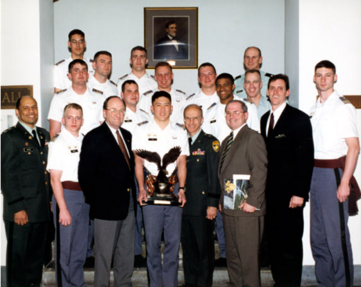
Figure 3: The winning Cyber Defense Exercise Team posing with NSA and USMA leadership after the presentation of the NSA Director's Trophy.

The initial plans for network defense by the West Point Teams in the Cyber Defend Exercise were not very mature. Even though the students were required to develop attack trees [6], the plans did not exhibit good breadth or depth. The second iteration of the plans were much better but if completely implemented still would not form a coherent defense. Clearly abstract discussions of computer network defense did not develop clear understanding of a coherent defense in cyberspace in the students. During the configuration of the network the teams finally began to understand what securing a network entailed. We think that this experience is similar to teaching design in software engineering. Students generally only understand what is required in a complete, consistent design when they have to implement a design.