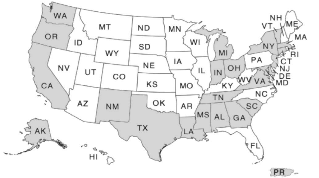
Figure 1. Location of SDFs as of March 2014. 19

Militia, and New Jersey Naval Militia were activated to assist in response measures, recovery efforts, and critical infrastructure security.” 18