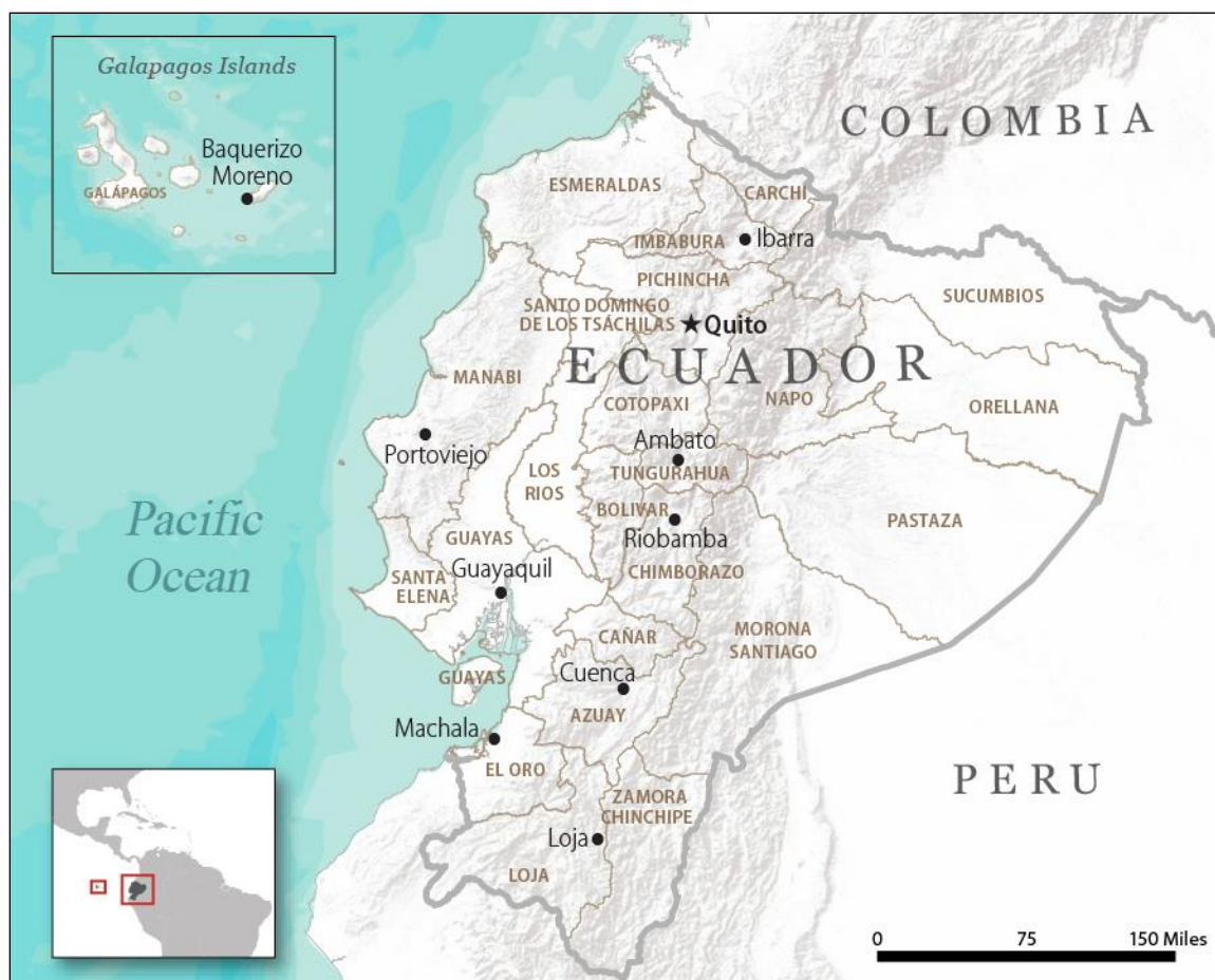
Figure I. Map of Ecuador and Ecuador at a Glance