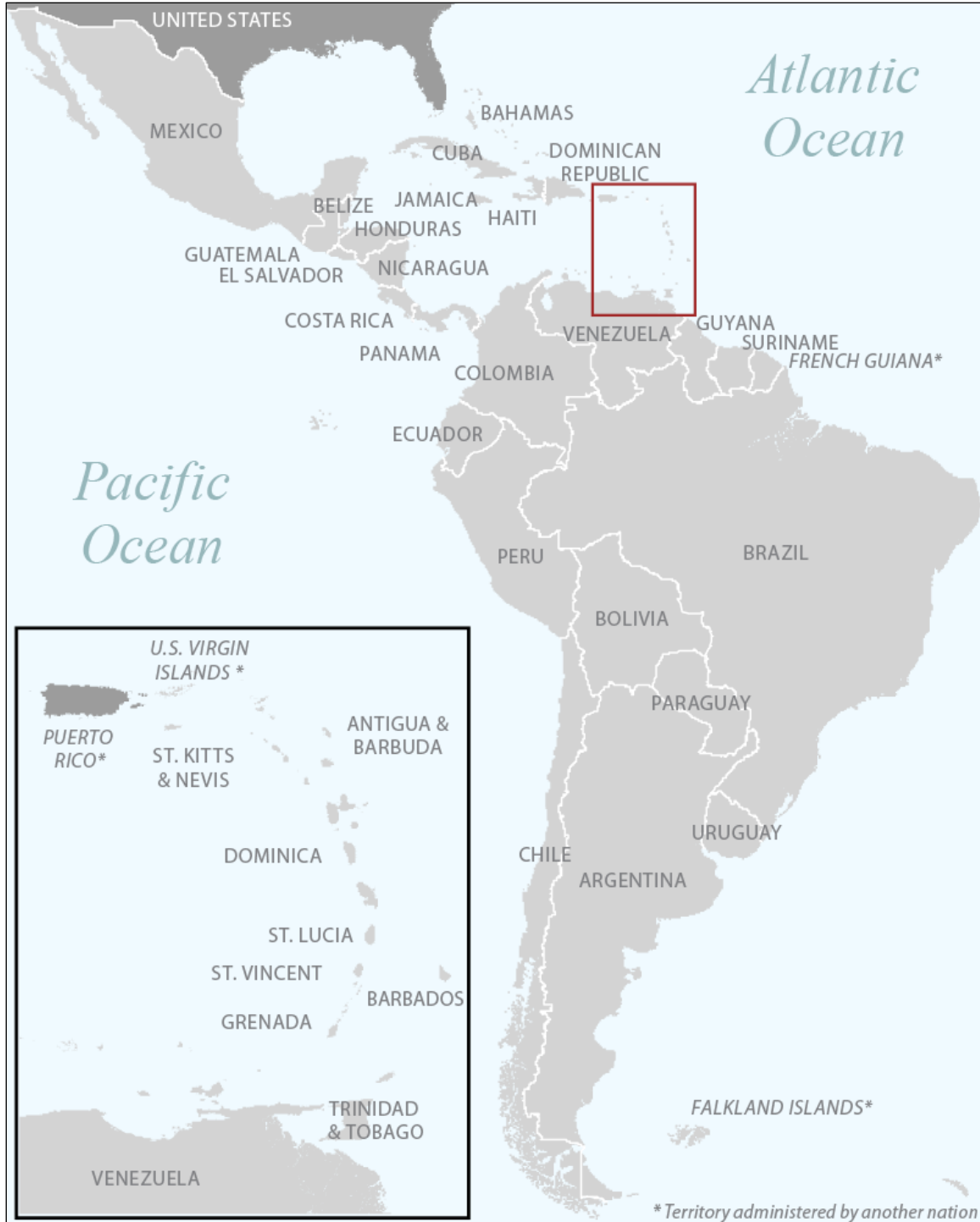
Figure I. Map of Latin America and the Caribbean