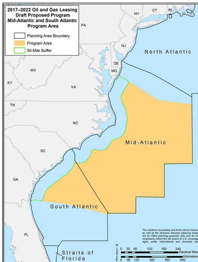
Figure 2. BOEM’s Originally Proposed Program Area for Offshore Oil and Gas Leasing in the Atlantic (subsequently removed from the five-year program)

situation as a factor in its decision not to hold an Atlantic lease sale in the 2017-2022 period. Given growth over the past decade in onshore energy development, the Administration stated, “domestic oil and gas production will remain strong without the additional production from a potential lease sale in the Atlantic.” 51