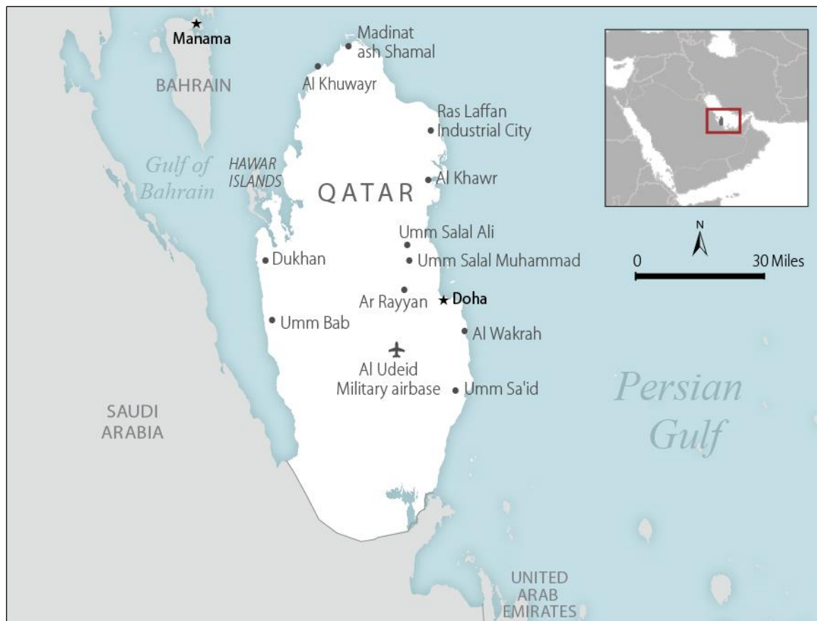
Figure I. Qatar At-A-Glance