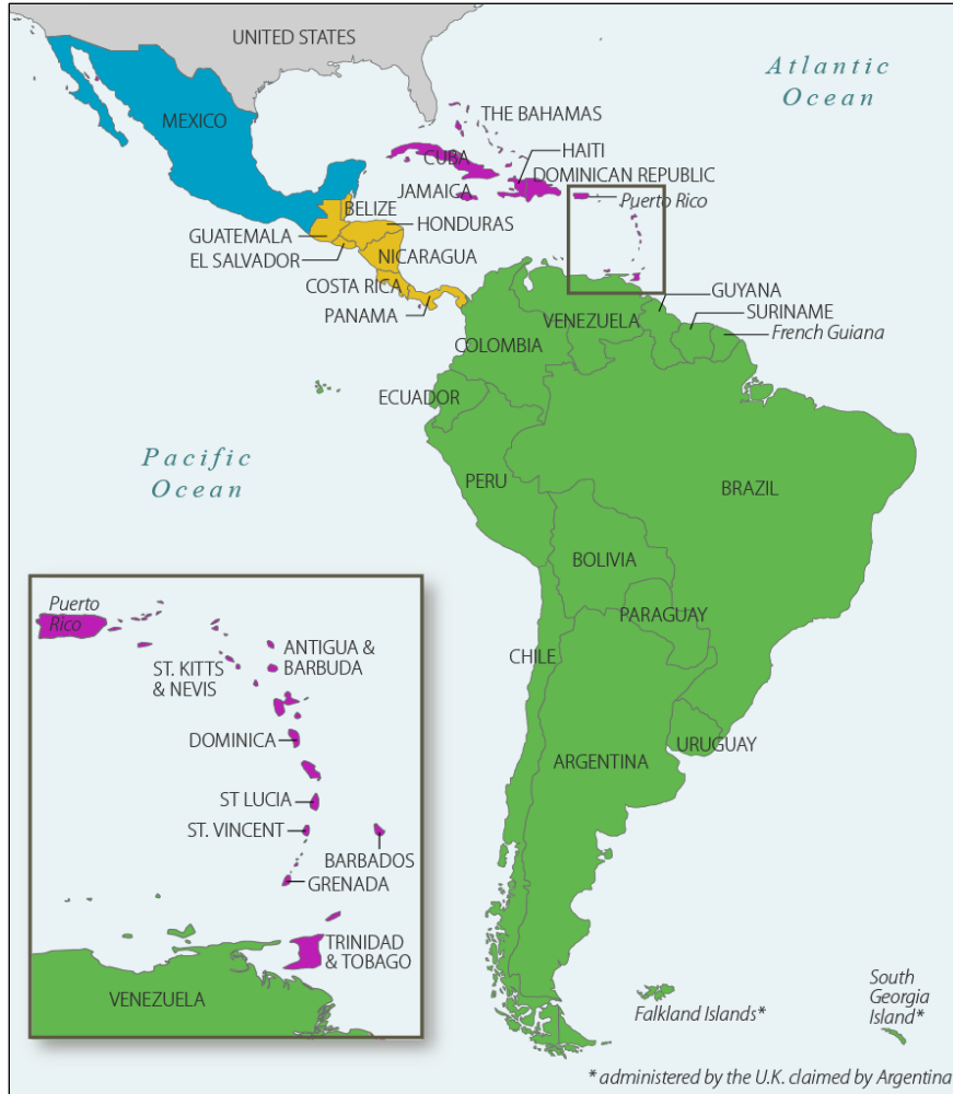
Figure I. Map of Latin America and the Caribbean