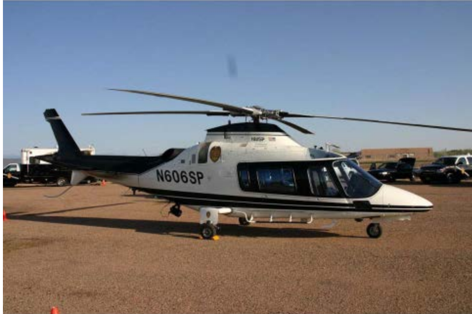
Figure 2. New Mexico State Police Agusta A-109E Helicopter, N606SP 33

According to the NTSB report, the NMSP dispatched the rescue after a hiker called 911 stating she was lost. 34 The Japanese hiker was not fluent in English. The lost hiker, feeling very cold, informed NMSP she was lost and separated from her party. The hiker further stated she was located somewhere in the Pecos Wilderness Area. The NMSP Dispatch Office made the decision to initiate the search and rescue call and dedicate the appropriate resources. 35