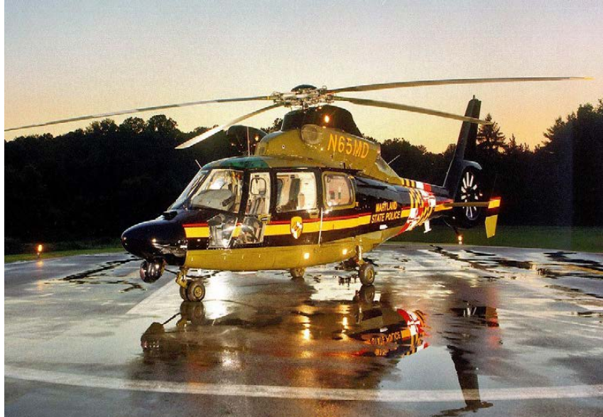
Figure 6. Maryland State Police Airbus AS365N1 Dauphin Helicopter 57