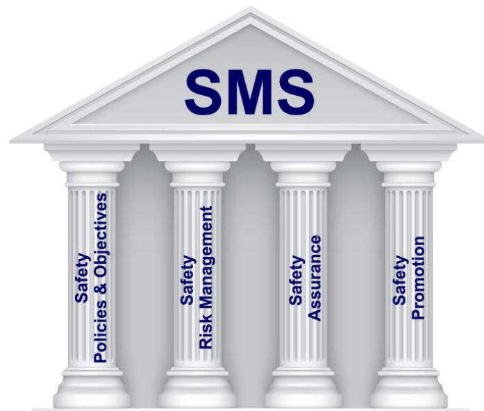
Figure 1. The Four Pillars of the Safety Management System 28

The PSAAC standards have a mission specific approach to the safety management systems (SMS) as recommended by the NTSB. SMS is a safety program similar to the U.S. Army that contains the structure for using policies and procedures to reduce risk. One important factor of the SMS is the continual improvement of the safety program. The SMS helps reduce the risk in operations by using four pillars of safety (see Figure 1).