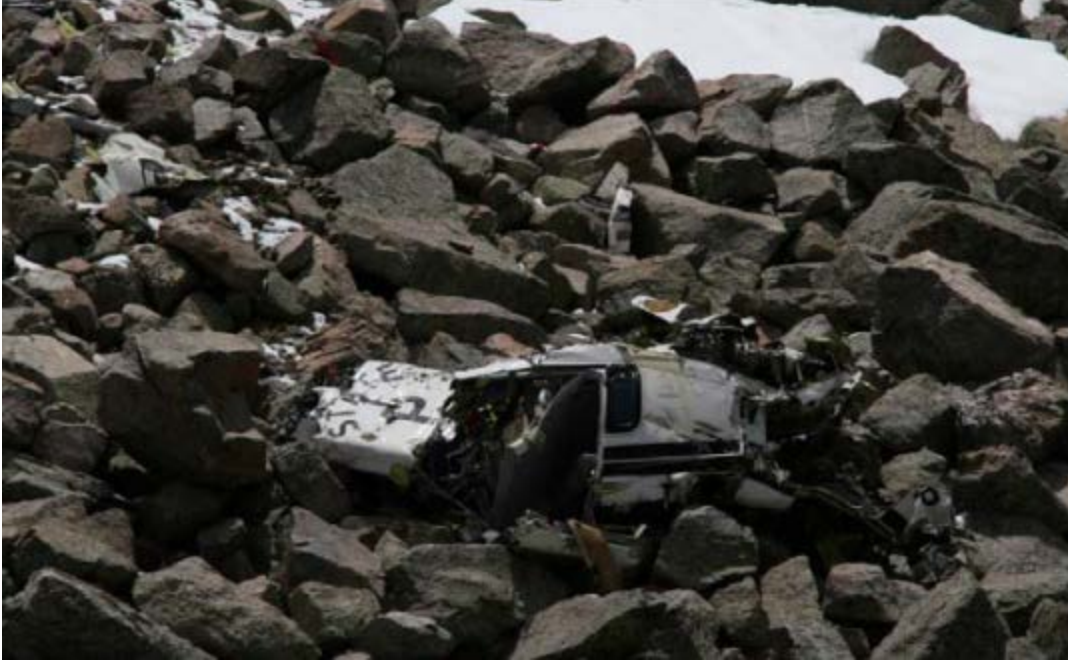
Figure 3. Crash Site of the NMSP Agusta A-109E Helicopter 36