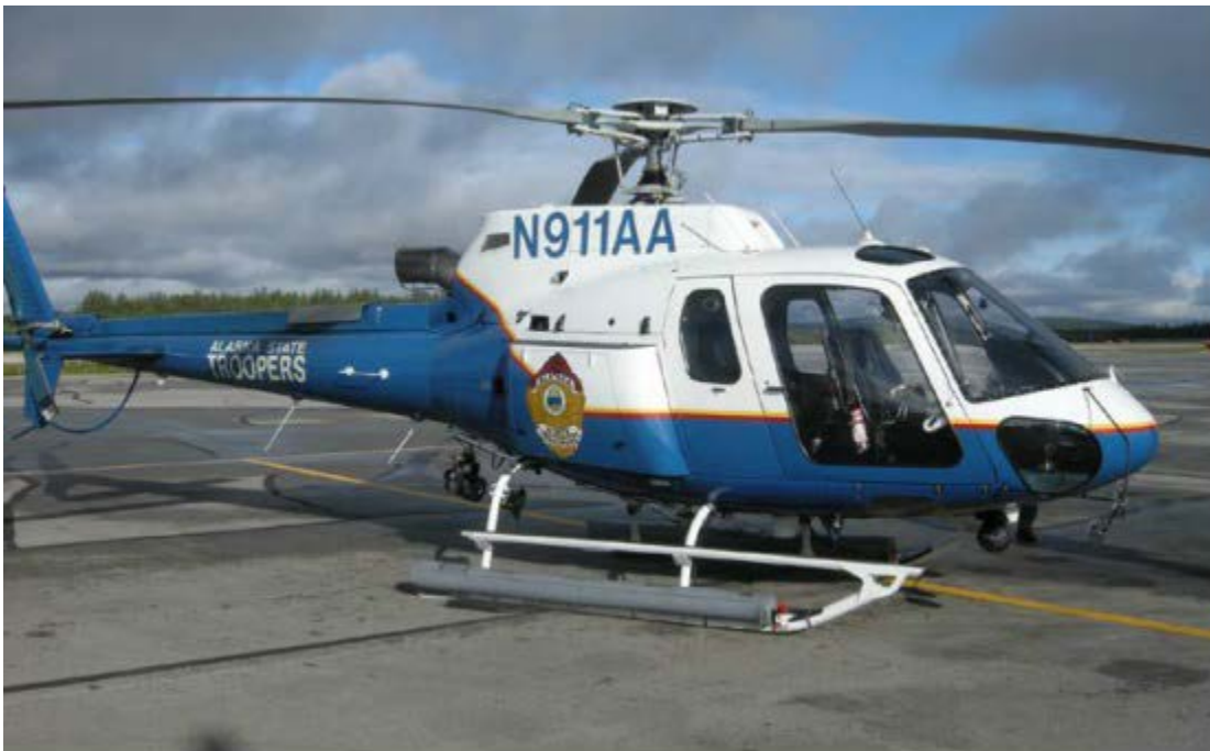
Figure 4. Alaska State Trooper Airbus AS350B3 Helicopter, N911AA 45

Talkeetna, Alaska. 43 The aircrew and the snowmobiler were fatally injured in the crash. The helicopter was shattered upon impact with the terrain and was damaged well beyond repair (see Figure 5). The pilot and flight observer were full-time, sworn Alaska State Troopers. The mission was a Public Aircraft Operation (PAO) flight since the mission was search and rescue. The weather conditions near the site of the rescue were reported to be weather below the requirements for visual flight rules (VFR). 44