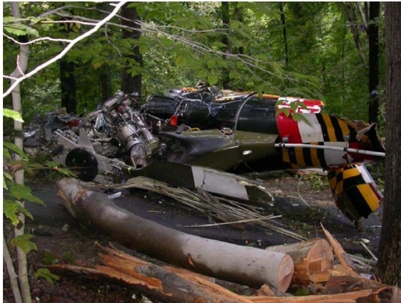
Figure 7. Crash Site of the Maryland State Trooper Airbus AS365N1 58