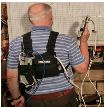
Measuring a shooter's physical recoil response

Constant recoil from repetitive firing has led to law enforcement officers developing stress injuries and caused them to take extended sick leave or medical retirement. To address this concern and reduce physical strain on OFTP testers, the DHS Science and Technology Directorate (S&T) worked with Radiance Technologies to develop a gun holder device—the Virtual Shooter—to mimic the movements and reactions of a human firing a gun.