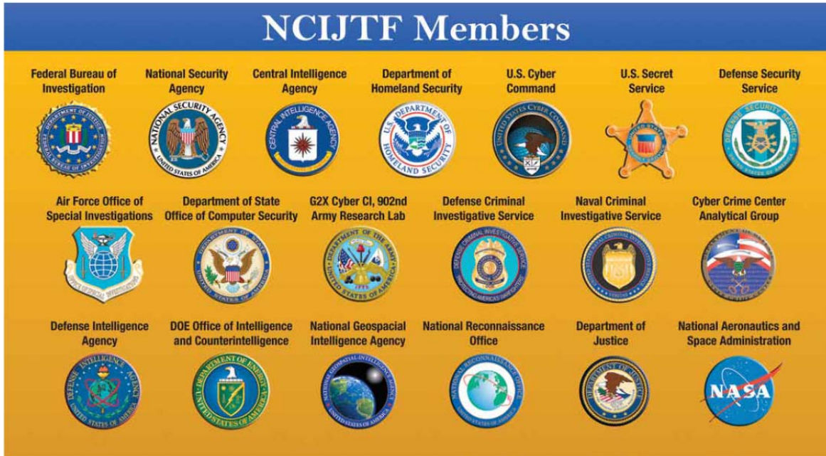
Figure 2. NCIJTF Members 181

Established by the FBI in 2008, the National Cyber Investigative Joint Task Force (NCIJTF) consists of more than 20 government agencies responsible for coordinating and integrating cyber-threat investigation services for national security. 180 Figure 3 depicts the members of NCIJTF.