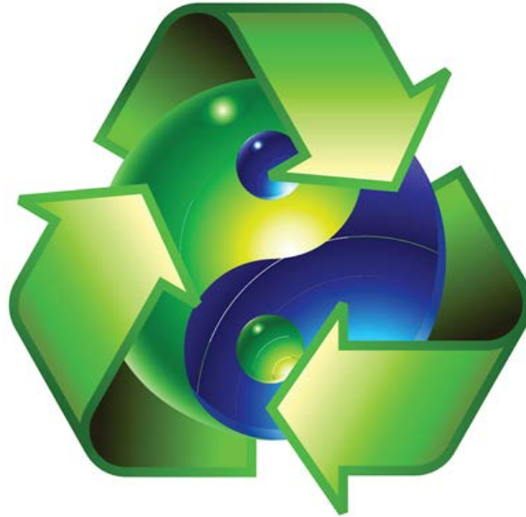
Figure 3. Conceptual Model Graphic

The conceptual model of leadership proposed combines the visual for the yin yang, symbolizing strength through coexisting and complementary opposites, with the proposed added level of synchronicity. It may be more philosophy than practice, but the shift in the authorization for a different style is central to the leadership and cultural evolution in the first responder community, the creation of a new archetype, and potentially an evolved meme of leadership.