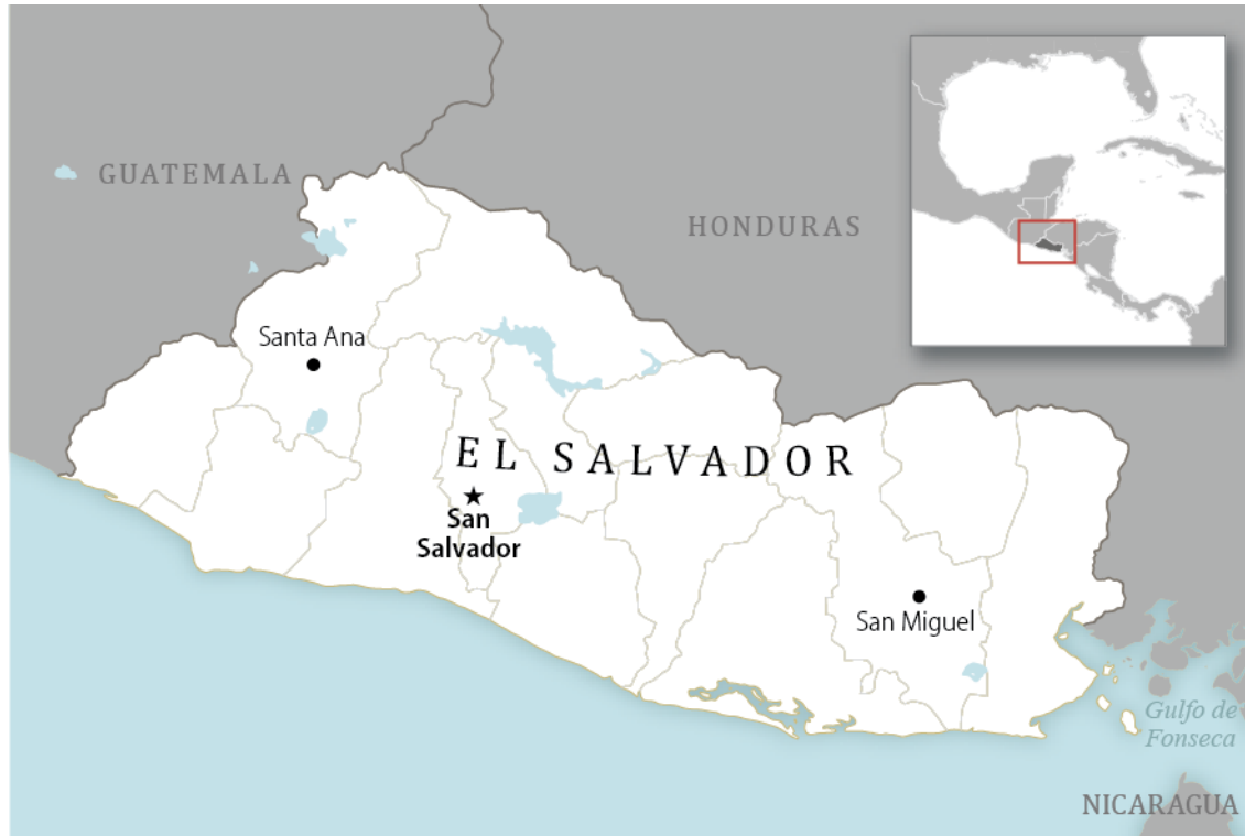
Figure 1. Map of El Salvador and Key Data on the Country

U.S. involvement in countering the insurgency in El Salvador could make relations with the Sánchez Cerén government difficult, bilateral relations have remained friendly.