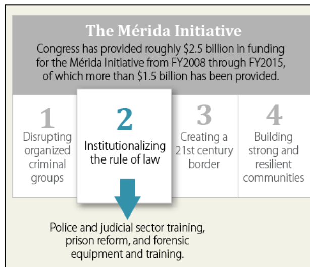
Figure I. Current Status and Focus of the Mérida Initiative

Congress has played a major role in determining the level and composition of Mérida Initiative funding for Mexico. From FY2008 to FY2015, Congress appropriated nearly $2.5 billion for Mexico under the Mérida Initiative (see Table 1 for Mérida appropriations and Table A-1 in Appendix for overall U.S. assistance to Mexico since FY2010). In the beginning, Congress included funding for Mexico in supplemental appropriations measures in an attempt to hasten the delivery of certain equipment. Congress has also earmarked funds in order to ensure that certain programs are prioritized, such as efforts to support institutional reform. From FY2012 onward, funds provided for pillar two have exceeded all other aid categories. In FY2015, Congress provided $28.6 million above the Administration's request, with additional funding for justice sector programs and efforts to help secure Mexico's southern border.