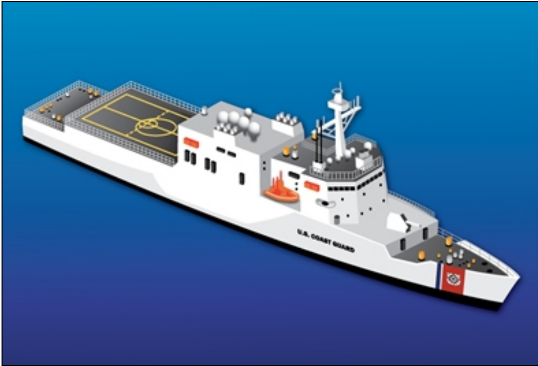
Figure 2. Offshore Patrol Cutter (Generic Conceptual Rendering)