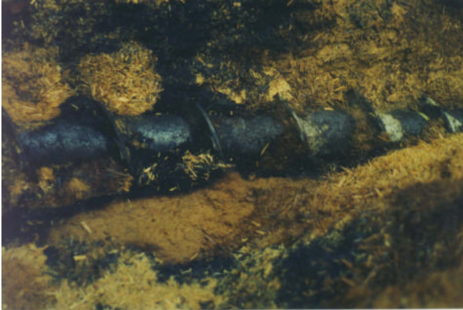
Photo 7. Fire travel along auger shaft