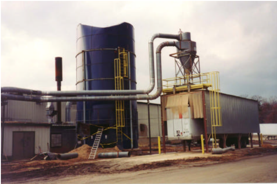
Photo 1. Silo with trailer shed to right and manufacturing facility in background