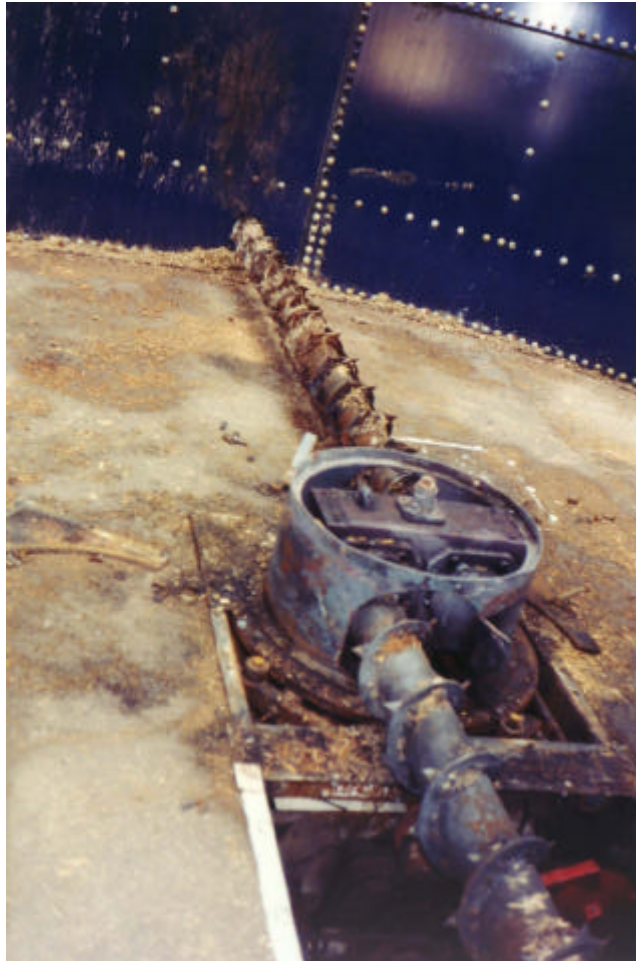
Photo 4. View of auger inside silo; fire burned along the auger shafts to access panels