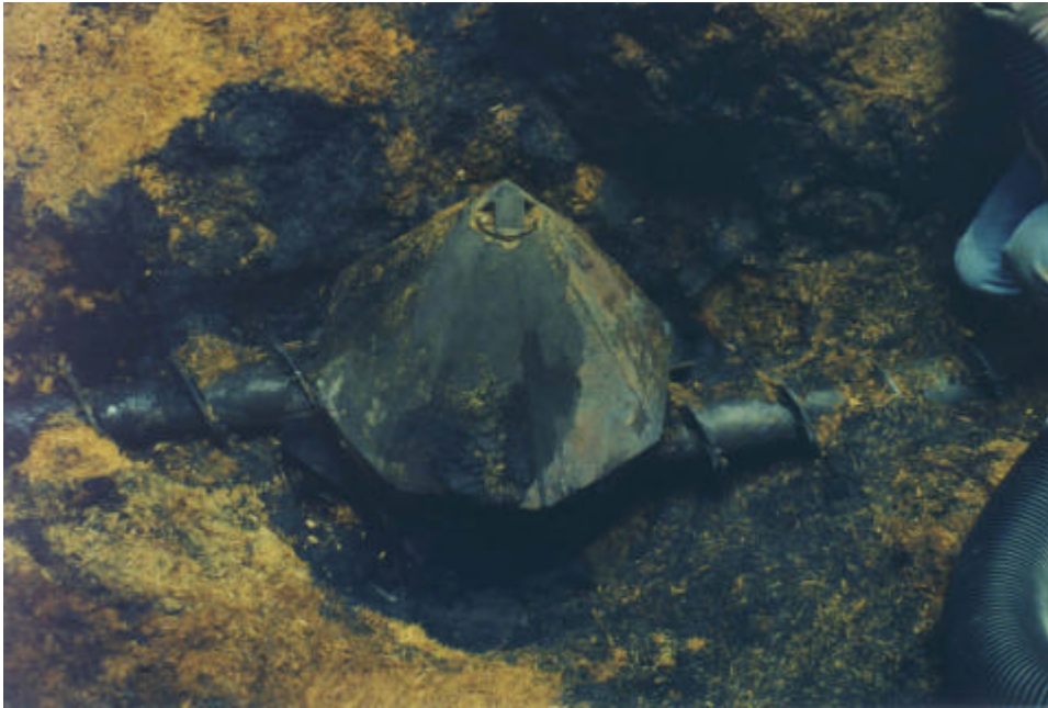
Photo 6. Auger gear box, covered by a shield suspected origin of fire