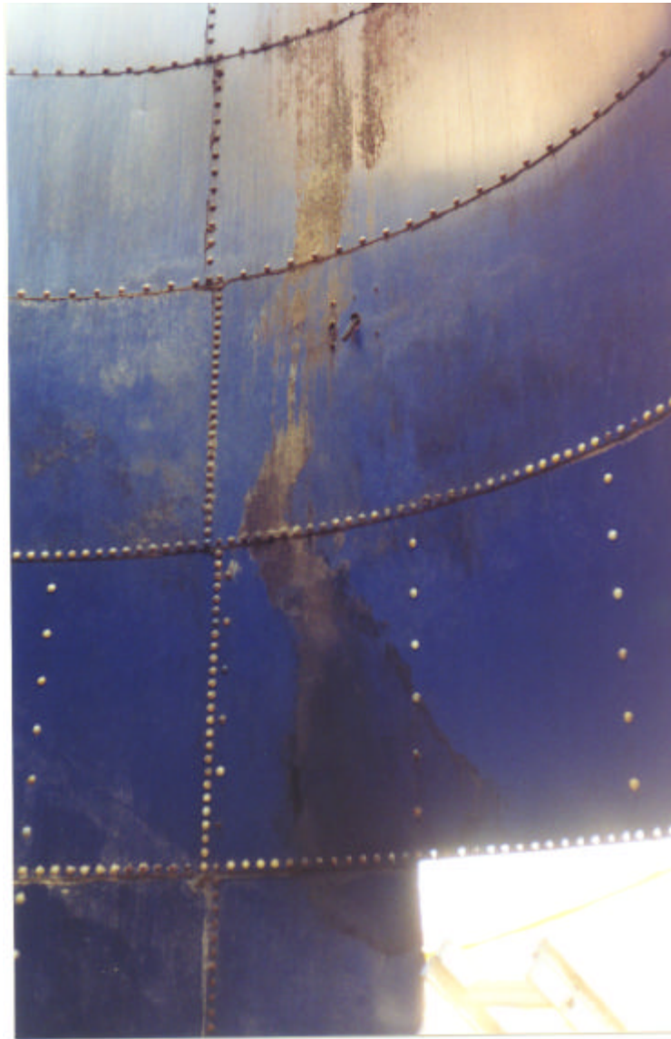
Photo 8. View from inside silo showing burned-out areas in relation to access panel (origin of explosion)