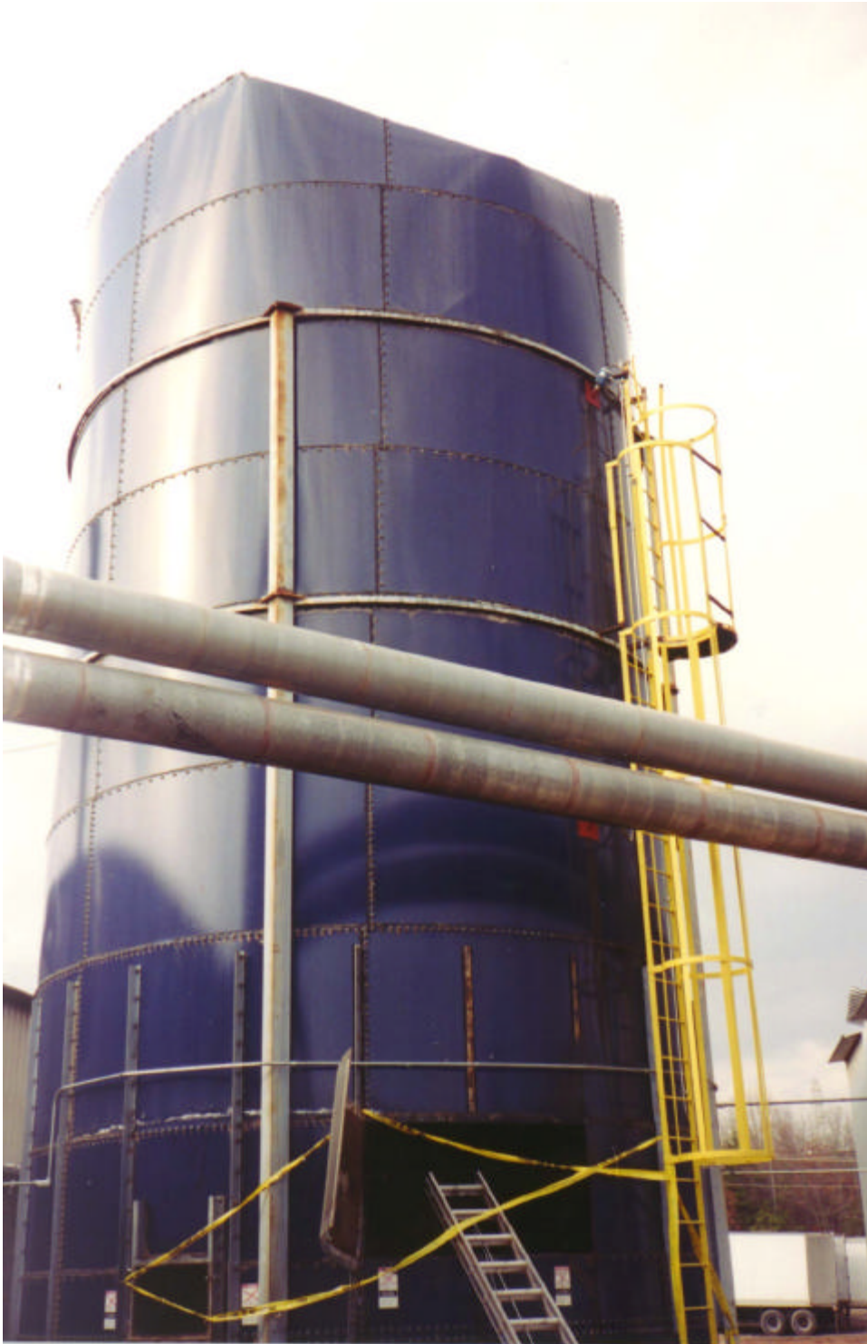
Photo 2. Access plate, origin of explosion