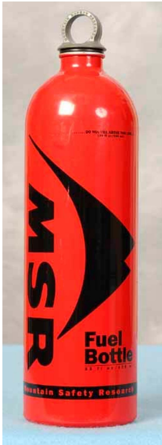
An older MSR bottle that also complies with GSA requirements