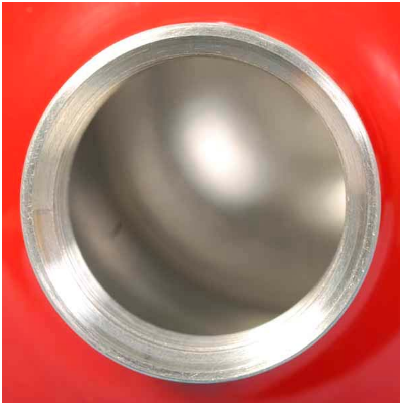
The mouth of a compliant fuel bottle. Note the lack of a crimp line.