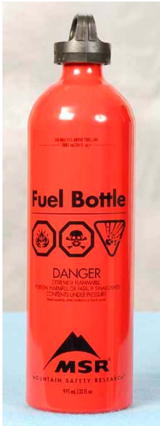
A new style MSR bottle with a childproof cap. These bottles comply with GSA requirements