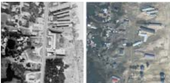
Figure 2: A coastal area before and after the storm.

It became immediately apparent that local governments had a wealth of digital GIS information that could be extremely beneficial to emergency responders. This data was available from over half of the affected counties and the accuracy and currency was much better than the Census data that FEMA has had to rely on. Many examples were given on how digital parcel information from local governments could improve the ability of FEMA and state agencies