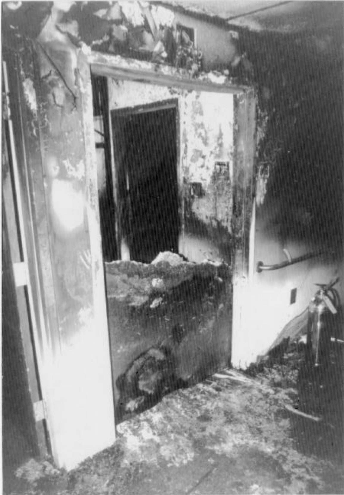
There was heavy smoke and heat damage around the door to the room of origin. The top portion of the door burned away in the fire.