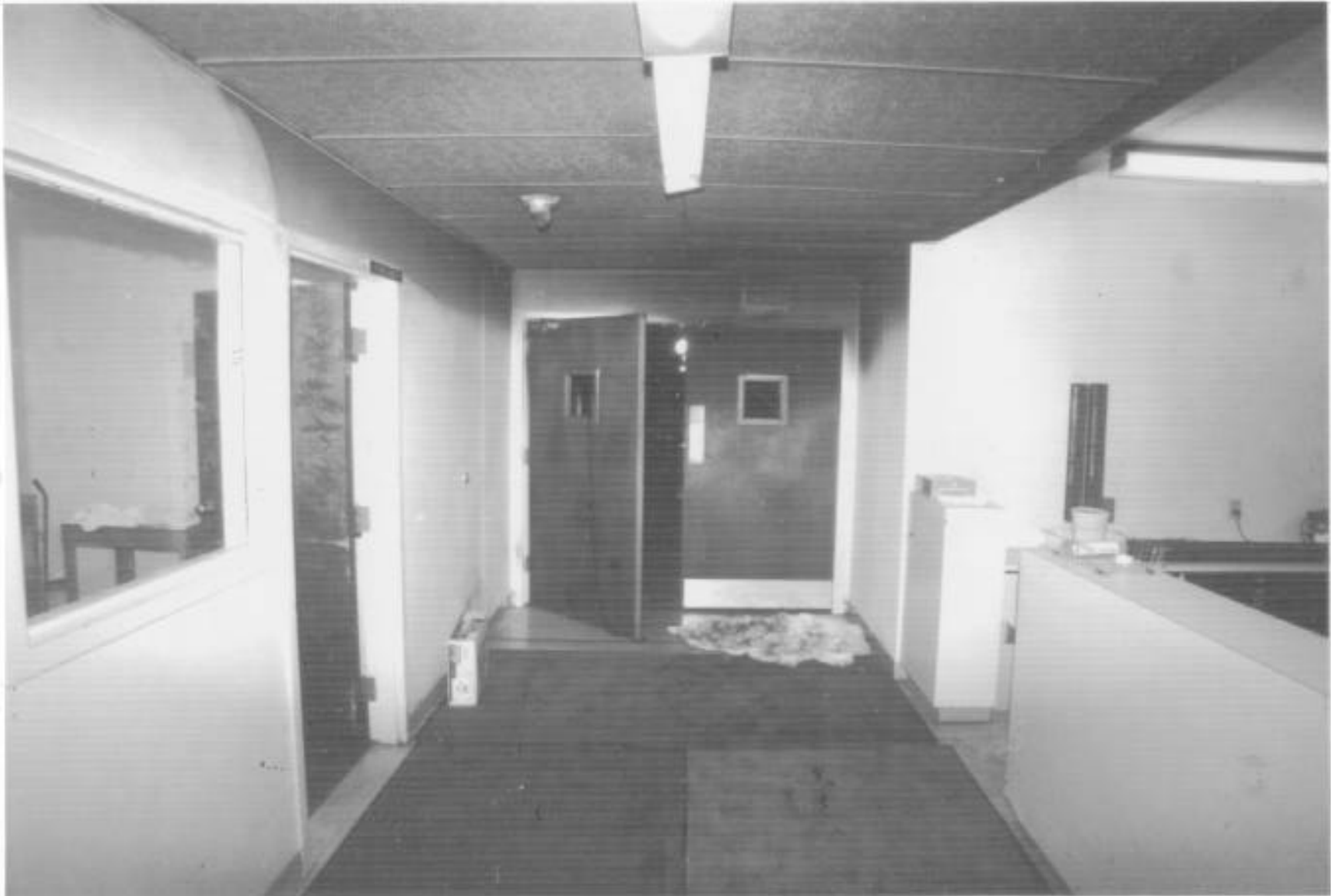
This photo looks down toward the south corridor with the nurses station on the right. The self-closing smoke control doors contained the bulk of the smoke and heat conditions to the corridor of origin, but some smoke escaped into the nurses station area as victims were evacuated through the doors.