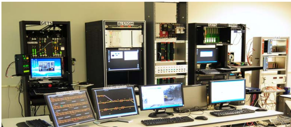
Figure 1. Setup for the Interoperable Communication-based Signaling Demonstration

The four suppliers demonstrated that their modified wayside equipment operated within the test environment and was interoperable with the other suppliers equipment. Two of the suppliers demonstrated their carborne equipment operated within the system (including across all four suppliers waysides) and was interoperable within the overall system.