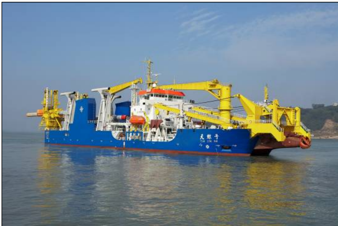
Figure 3. The Tianjing (“Sky Whale”) Self-Propelled Cutter Suction Dredger Involved in Reclamation Work in the Spratly Islands