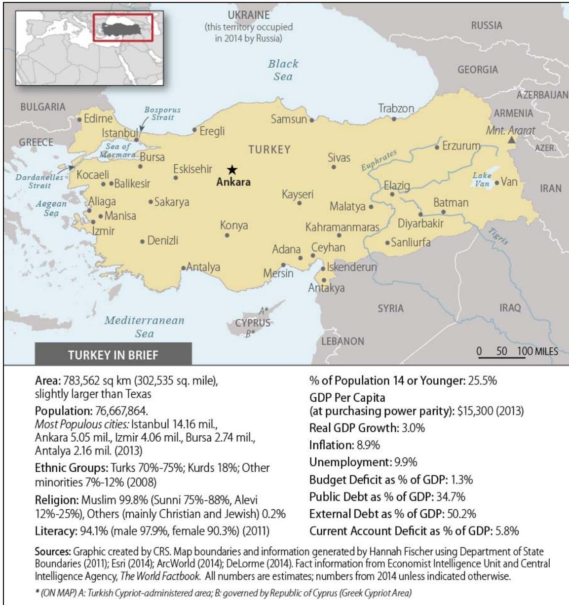
Figure I. Turkey: Map and Basic Facts

Domestic political changes from a military-guided leadership to a civilian one based largely on conservative Sunni Muslim majority sentiment may have heightened Turkish leaders' reluctance to support Western military action (such as ongoing action in Syria and Iraq), which many Turks describe as targeting Sunni Muslims. 5 According to one prominent U.S.-based commentator, "Sunni sectarianism and Islamic romanticism in pursuit of Muslim Brotherhood priorities" 6 have helped drive Turkish foreign policy in recent years. Such perceptions may have led to or reinforced differences between Turkey and the United States on issues such as these: