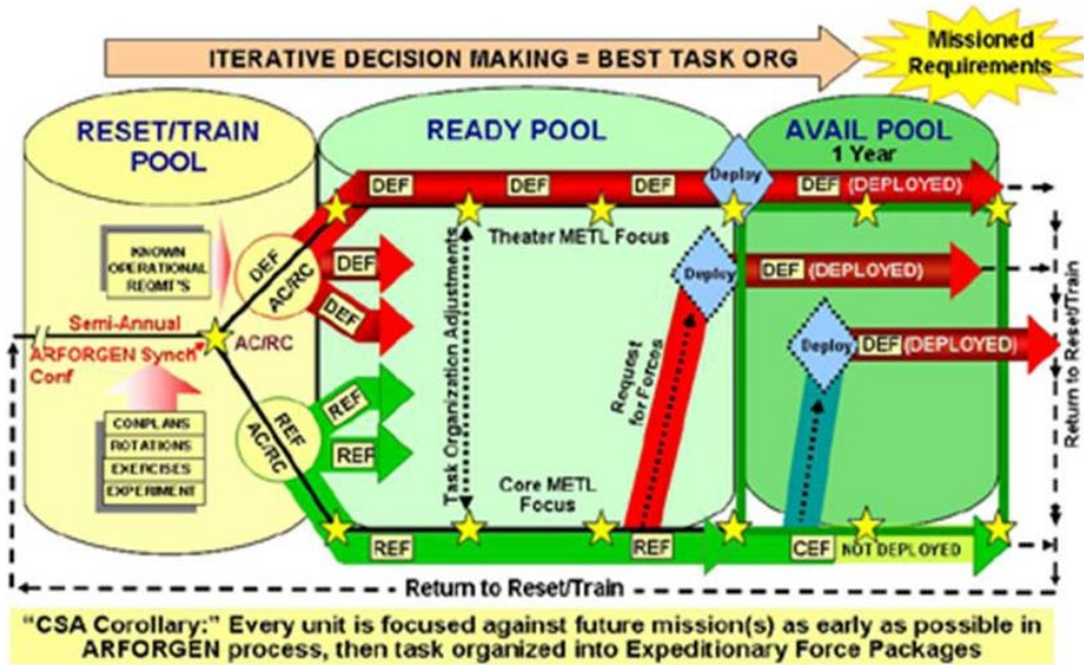
Original ARFORGEN Model 28

ARFORGEN conceptually created three equal sized force pools – reset, train/ready and available pools - (Figure 1) based on availability for steady-state rotation. Units linearly progressed along a timeline with specific activities, capabilities and transition requirements for each pool. Additionally, units were designated as either deployment expeditionary forces (DEF)