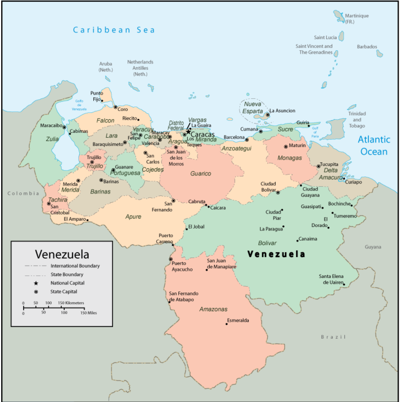
Figure I. Map of Venezuela