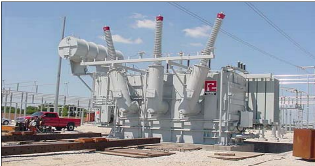
Figure 3. 345 kV Transformer Installation