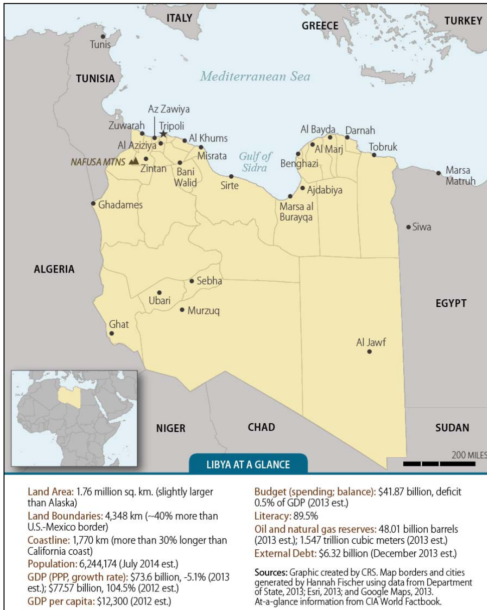
Figure 2. Libya: Map and Select Country Data

The revised transitional roadmap currently calls for an elected Constitutional Drafting Assembly (CDA) to produce a draft constitution for consideration by elected legislators and the Libyan public. Forty-eight out of 60 of the Assembly’s members were elected in February 2014 amid very low voter turnout; the remaining 12 seats were not filled due to boycotts and security disruptions, but are being filled as follow-on elections are held. As of May 14, Libya’s High National Election Commission reported that 55 members had been elected. According to the 2011 interim constitutional declaration, the CDA is scheduled to have four months from its first session to produce a draft constitution for consideration, a timeline which many outside observers viewed as ambitious and potentially problematic even prior to recent events. The CDA held an initial meeting on April 20, in Al Bayda, and is consulting with Libyans and international supporters.