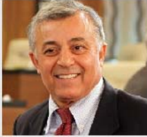
Figure I. Select Libyan and U.S. Figures