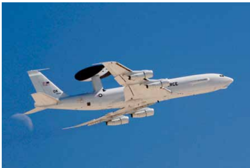
An E-3 Sentry AWACS aircraft takes off from Nellis Air Force Base, Nev.

Purpose: C2 is the Core Function primarily responsible for providing Decision Superiority to the global force. In order to achieve decision superiority, Airmen employ C2 capabilities through robust, adaptable, and survivable C2 systems. These systems rely on access to reliable and trustworthy communications and information networks across a range of joint military operations and environments.