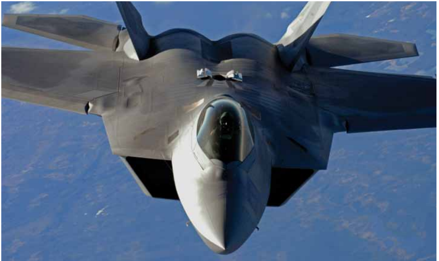
An F-22 Raptor receiving fuel from a KC-135 Stratotanker.

Securing the High Ground articulates the guiding principles and foundational ideas for providing America with dominant combat airpower. Within the context of the current strategic and fiscal environments, these principles guide the transformation of today's Air Force into the Air Force of tomorrow. There are two main lines of effort in this document to achieve this objective: