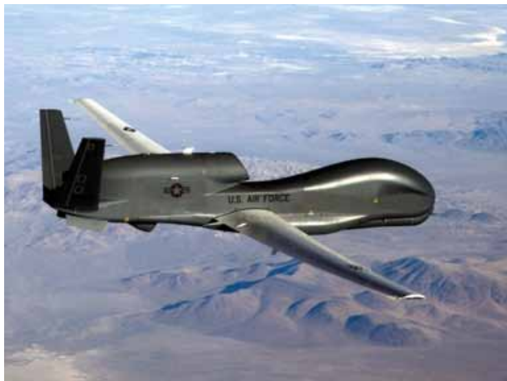
RQ-4 Global Hawk

Purpose: GIISR is the Core Function primarily responsible for providing Decision Advantage and Precision Attack to the Joint Force. To do this, GIISR must possess capabilities to effectively access targets of interest, define targets and their location in time and space in relation to adversary threats, and characterize the battlespace. The GIISR enterprise conducts operations to validate knowledge, test theories, and discover unknowns in order to enhance warfighter readiness, and combat systems, and support future weapons system development. In this regard, GIISR enhances airpower kill-chains and is essential to Global Power.