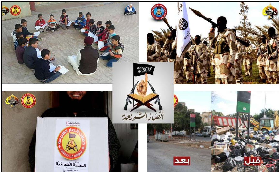
Figure 3. Recent Ansar al Sharia Imagery from Libya and Syria