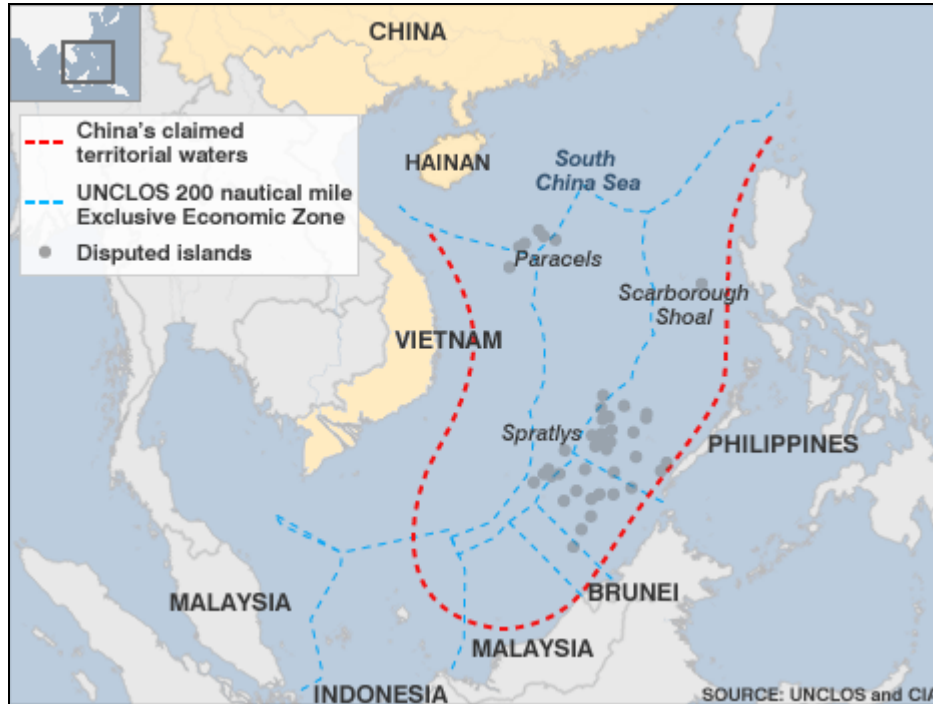
Figure 2. Contested Boundaries in the South China Sea

blocked two Philippine supply ships from reaching the Sierra Madre , claiming that they were carrying construction materials.