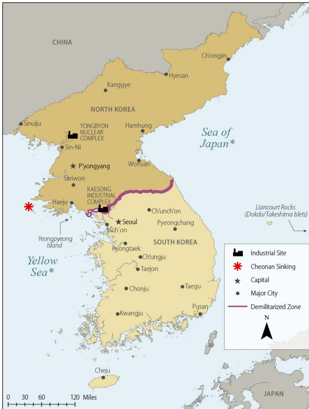
Figure I. Map of the Korean Peninsula

Sources: Map produced by CRS using data from ESRI, and the U.S. Department of State's Office of the Geographer.