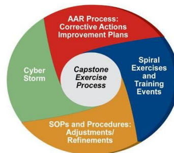
Figure 1: The Cyber Storm Exercise Series Is Part of a Continuous Process.

The National Cyber Exercise: Cyber Storm (CS) is the Department of Homeland Security's (DHS) capstone national-level cybersecurity exercise and represents the Nation's most extensive cybersecurity exercise effort of its kind ( Figure 1 ). CS is a Homeland Security Exercise and Evaluation Program (HSEEP) Tier II exercise focusing on federal strategy and policy. The Department's National Cyber Security Division (NCS) sponsors the biennial exercise to improve the capabilities of the cyber incident response community; encourage the advancement of public-private partnerships within the critical infrastructure sectors; and strengthen relationships between the Federal Government and partners at the state, local, and international levels. The CS exercise series provides the cyber incident response community with the opportunity to continuously learn and assess its capabilities, building on previous experience, lessons learned, and exercise findings. DHS NCS successfully executed CS I in February 2006, CS II in March 2008, and CS III in September 2010. DHS has used the findings from these exercises to advance collective cyber incident response capabilities.