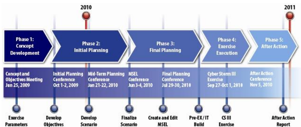
Figure 2: CS III Planning Timeline.

The Planning Team divided the 18-month planning process into five distinct stages that support planning, execution, and evaluation of the CS III exercise ( Figure 2 ). Within each stage, a series of events, milestones, and general planning goals moved the process forward. Throughout the process, significant cross-community interaction, public–private collaboration, and information sharing supported increased awareness of cyber-based threats, their potential implications, and the current response framework.