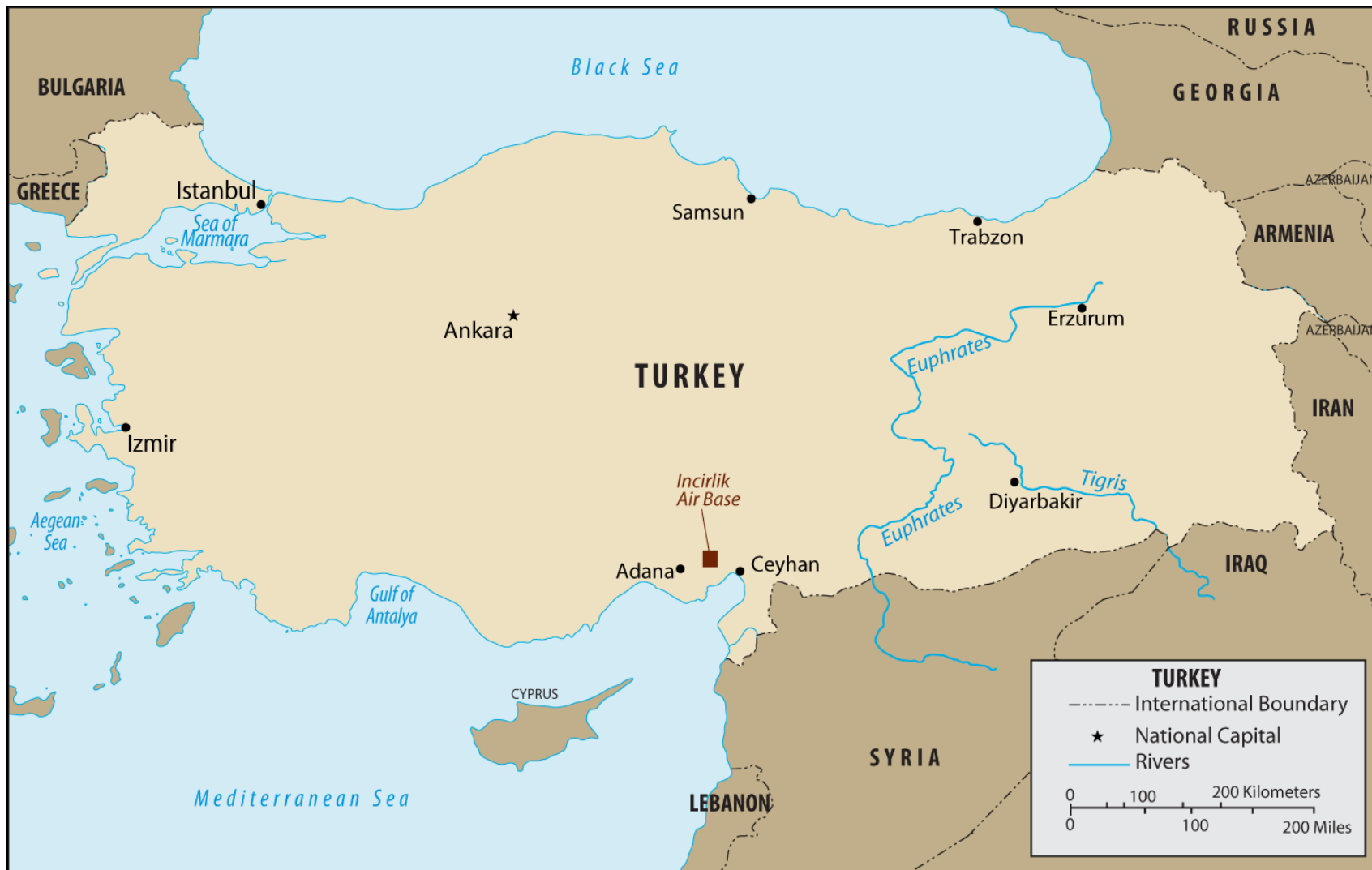
Figure I. Turkey and Its Neighbors